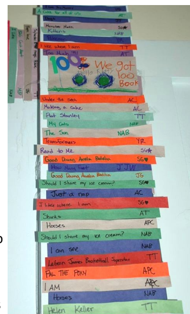
Books Read by the Children at the Community Family Development Center

With the help of their teachers and volunteers at